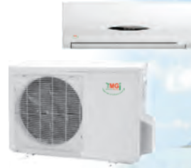
Sing Zone: 9,000, 12,000, 18,000, 24,000 Btu/h