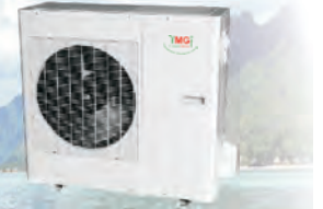
Dual Zone: 2x9,000, 2x12,000 Btu/h