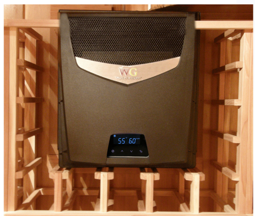
Front View in Racking