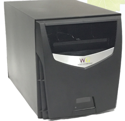
TTW unit out of racking