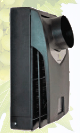
Back View With Optional Duct Adapter