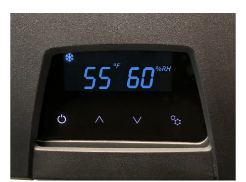
Front Digital Display