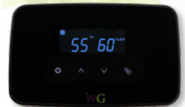
Remote user interface control system displays temperature in °F or °C