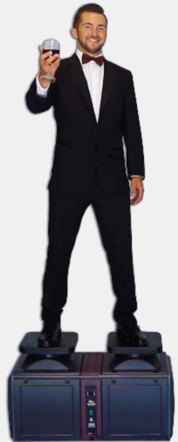
Do not attempt. Trained personnel in a controlled environment. *Patent Pending

*Not all options are available for all units. Contact a distributor for more information.