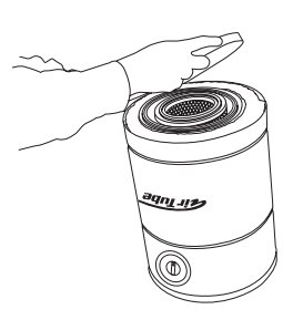
STEP 3 Remove lid by pulling slightly on cover.

STEP 2 Gently lay unit upside down. With a screw driver, remove all 4 screws.