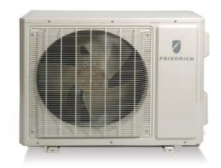
MRM18Y3J, MRM24Y3J, MRM36Y3J