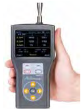
Streamlined & Lightweight